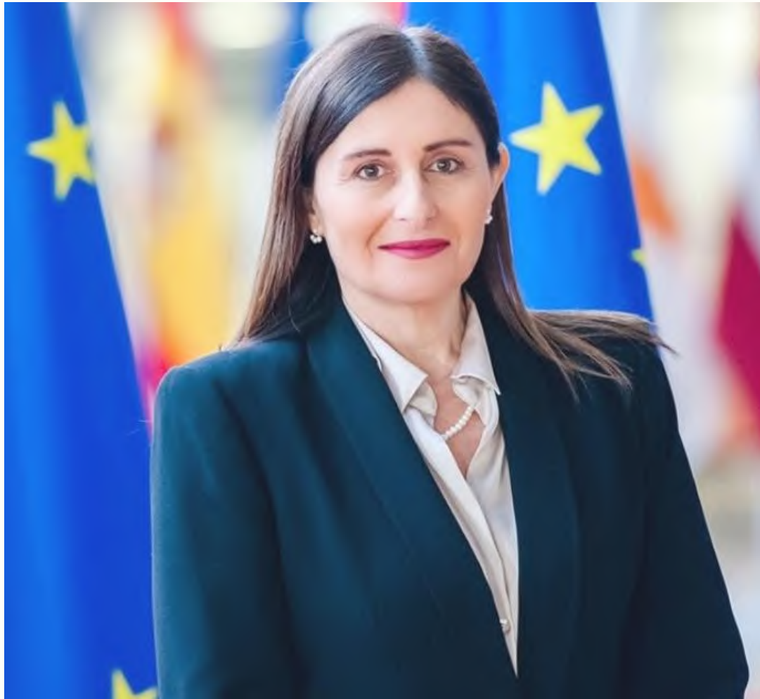
Shipping Deputy Minister of Cyprus Ms. Marina Hadjimanolis