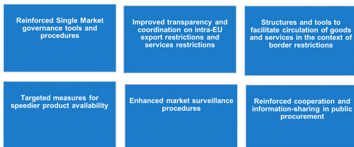
Figure 2 Key elements of the Single Market Emergency Instrument

2021, 16 the Commission will propose a Single Market Emergency Instrument to provide a structural solution to ensure the availability and free movement of persons, goods and services in the context of possible future crises. This instrument should guarantee more information sharing, coordination and solidarity when Member States adopt crisis-related measures. It will help to mitigate the negative impacts on the Single Market, including by ensuring more effective governance. It should also build a mechanism through which Europe can address critical product shortages by speeding up product availability (e.g. standard setting and sharing, fast-track conformity assessment) and reinforcing public procurement cooperation. It will be aligned with relevant policy initiatives such as the forthcoming proposal to establish a European Health Emergency Preparedness and Response Authority (HERA), and the upcoming Contingency Plan for Transport and Mobility as well as relevant international practice aiming at addressing emergency situations or ensuring and speeding up the availability of essential products.