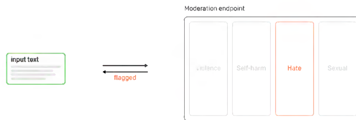
Figure 1: ChatGPT’s content moderation system 7 .

Given the significant wealth of information to which ChatGPT has access, and the relative ease with which it can produce a wide variety of answers in response to a user prompt, OpenAI has included a number of safety features with a view to preventing malicious use of the model by its users. The Moderation endpoint assesses a given text input on the potential of its content being sexual, hateful, violent, or promoting self-harm, and restricts ChatGPT’s capability to respond to these types of prompts 6 .