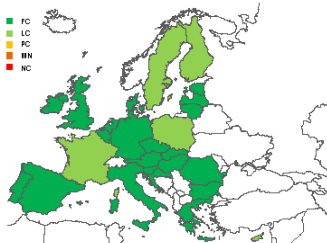
Figure 1 Addressees' compliance with Recommendation ESRB/2012/2 on funding of credit institutions

The figure above shows the overall compliance grade for each addressee based on the relevant Member State. The EEA and the ECB Banking Supervision are excluded from this illustration.