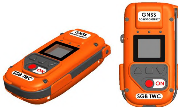
Figure 2: Mechanical design of a SGB TWC beacon prototype

19 The TWC service shall allow sending “1-way” instructions ‘how-to-act’ from SAR forces to beacon users.