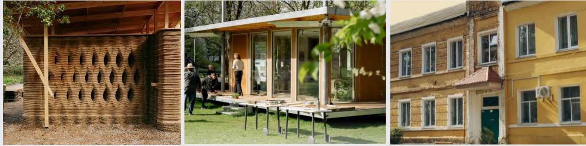
TOVA ©GregoriCivera - © NEBBourhoods - © TEPL0