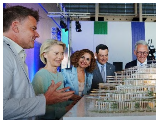
The future JRC building in Seville, built according to the NEB values and principles