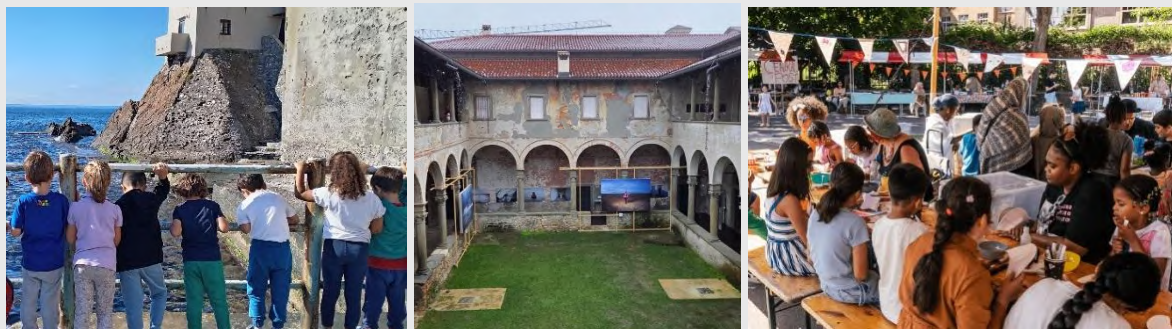
© Bauhaus of The Sea Sails - © Bauhaus4EU - © Cultuur&Campus

Education and culture are key to raise awareness on the benefits of holistic and explorative approaches in combination with evidence-based design methodologies. The Commission will promote NEB values in schools across Europe through the Education4Climate Coalition 28 and its work on School learning environments for sustainability 29 .