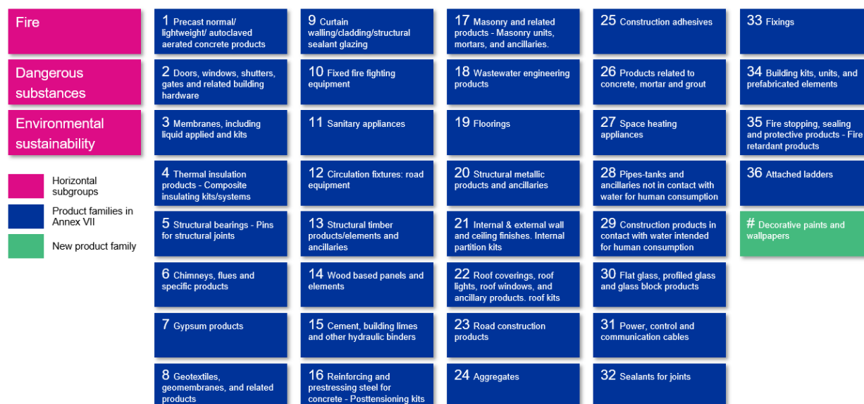
Figure 1: Structure of the CPR Acquis Expert Group and its Sub-Groups

encouraged to apply to become members in the Expert Group or in one or several of the Sub-Groups 12 to contribute to the work.