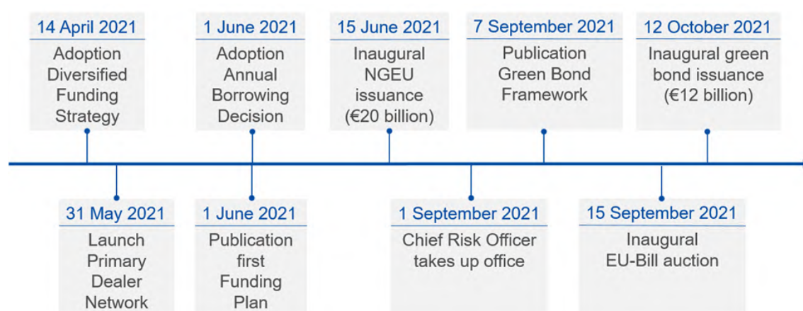
Figure 1: Milestones in building the diversified funding strategy

The NextGenerationEU funding programme is based on five key enablers: