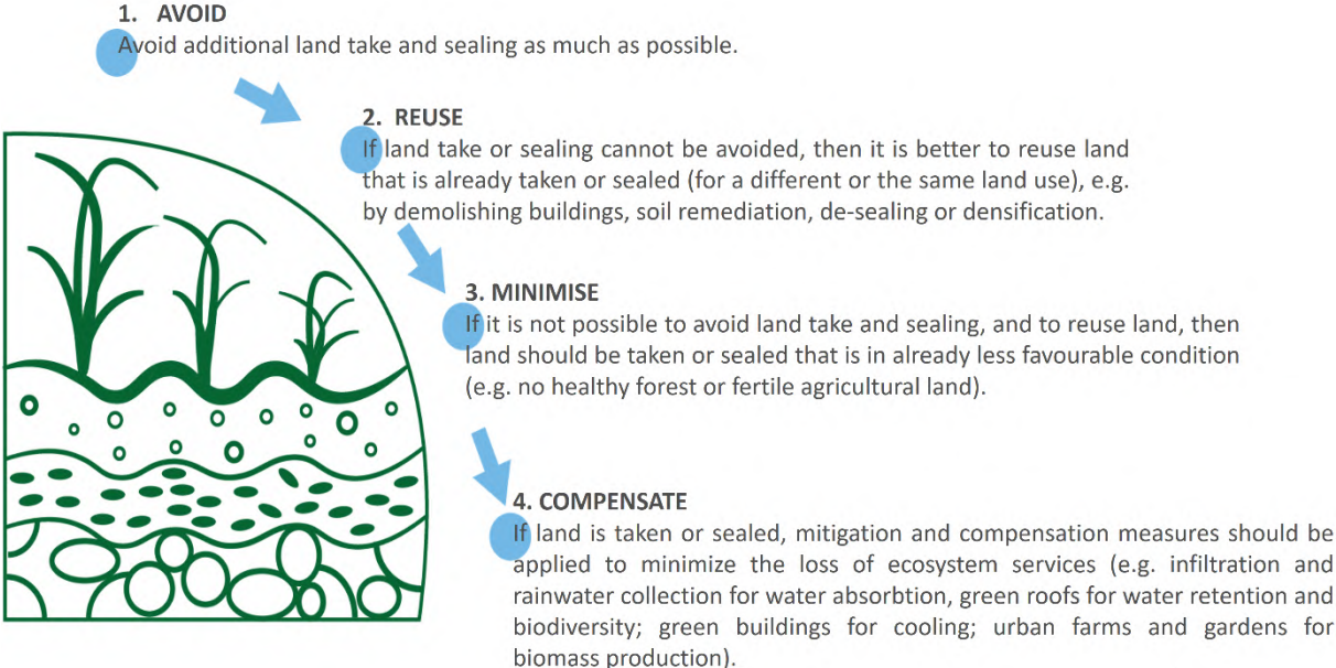
Figure 2: Land take hierarchy

improvement 52 . In fact, some Member States have achieved rates higher than 50%, and up to 80%, showing that sustained land recycling is possible. This spares natural areas for the benefit of biodiversity, forests and green spaces, land for food and biomass production, water and rainfall regulation. Hence, there is a need to apply a hierarchy in land planning .