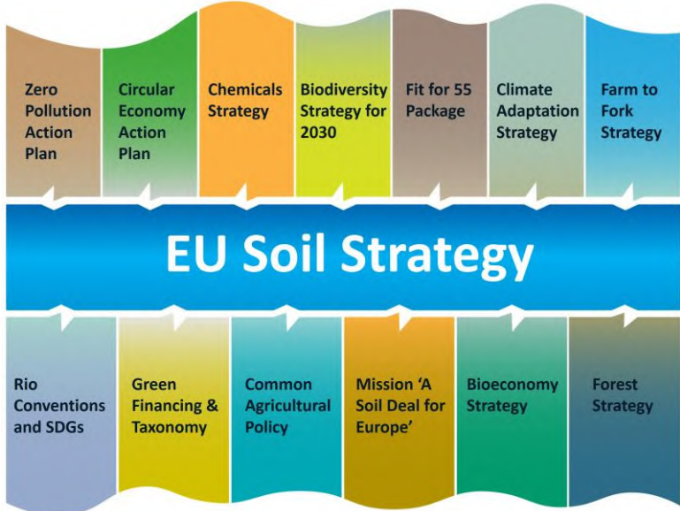
Figure 1: links between the EU Soil Strategy and other EU initiatives

To reap the benefits of healthy soils for people, food, nature and climate, the EU needs a renewed Soil Strategy that sets out a framework and concrete measures for protecting, restoring and sustainably using soils and that mobilises the necessary societal engagement and financial resources, shared knowledge, sustainable practices and monitoring to reach common objectives. The strategy is closely linked and works in synergy with the other EU policies stemming from the European Green Deal and will underpin our ambition for global action on soil at international level. This will only be achieved through a combination of new voluntary and legally binding measures, presented here below, developed in full respect of subsidiarity and building on existing national soil policies.