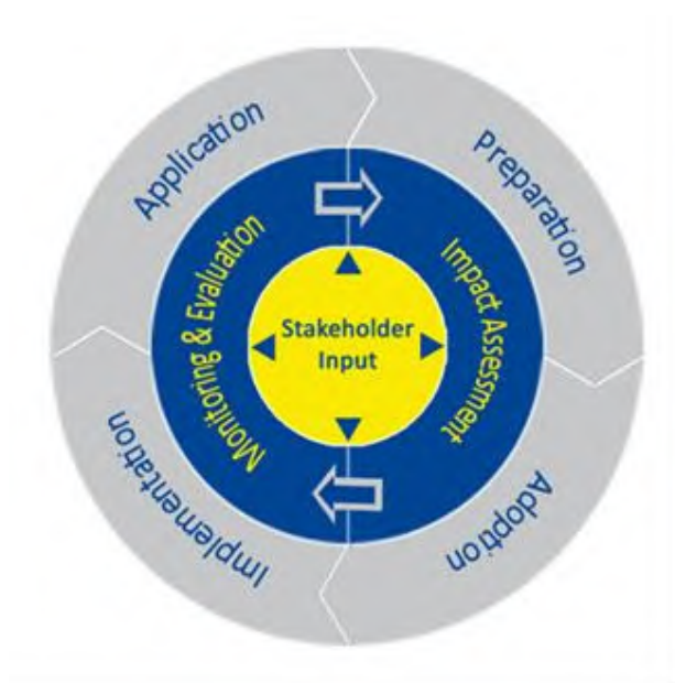
Figure 1. The EU policymaking cycle

‘Better regulation’ covers the whole policy cycle (see Figure 1), from policy design and preparation, through adoption, implementation (transposition, complementary non-regulatory action) and application (including monitoring and enforcement) to evaluation and revision. For each phase, there are relevant ‘better regulation’ principles, objectives, tools and procedures to make sure that the EU develops sound, evidence-informed policies. The following sections cover the main instruments of ‘better regulation’.