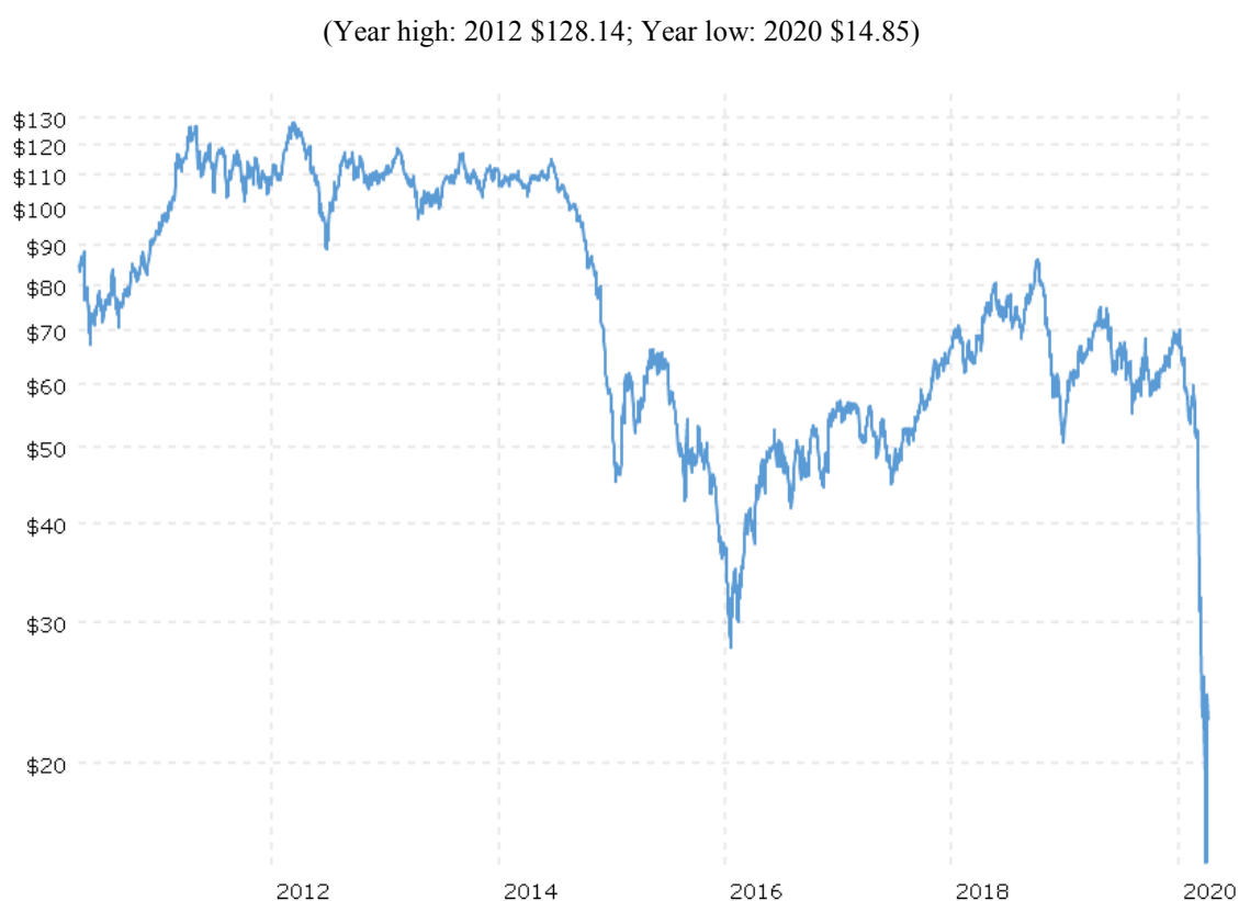
Figure 1: 10-year trend of Brent Crude price (US$/barrel)