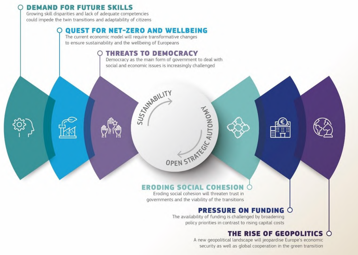
Figure 1: Key challenges for the EU's sustainability transition

We have been experiencing an era of permacrisis and polycrisis, with a conjunction of increasing effects of climate change and environmental challenges, the COVID-19 pandemic, and the Russian war of aggression against Ukraine. New conflicts and escalation of the existing ones, mass displacements, financial crises, or pandemics are other examples of potential crises we might face in the future. Finally, the unprecedented scale of the transitions creates various challenges affecting social and economic aspects of sustainability (Figure 1). Their intersections and combined effects will need to be taken into account to enable viable pathways towards Europe's sustainability.