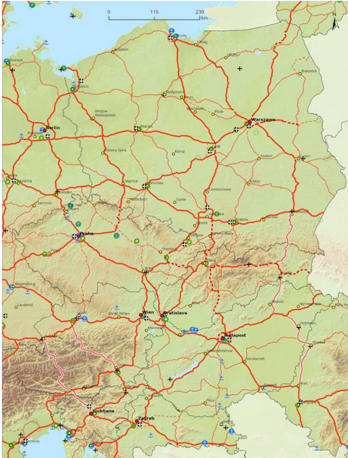
Roads Core Roads Extended Core Roads Comprehensive Compr Core Urban Nodes