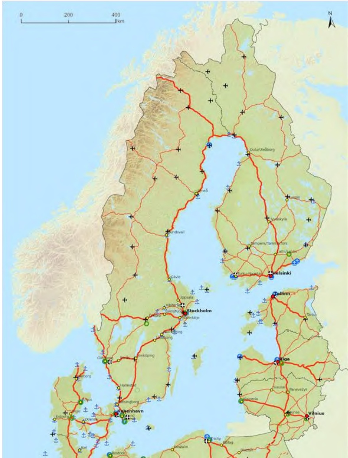
Roads Core Roads Extended Core Roads Comprehensive Compr Core Urban Nodes