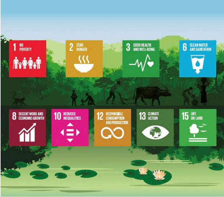
Figure 1 - Forest goods and services supporting the UN Sustainable Development Goals

Further EU measures to protect forests would be consistent with international agreements and commitments, which fully acknowledge the need for ambitious action to reverse the trend of deforestation. The Paris Agreement on Climate Change and the Global Strategic Plan for Biodiversity 2011-2020 adopted under the UN Convention on Biological Diversity and the Aichi Biodiversity Targets promote sustainable forest management, protection and restoration efforts xiv . Reducing forest loss and degradation is a priority under the UN Strategic Plan on Forests xv . Strengthening efforts to manage forests sustainably is also central to the UN 2030 Agenda for Sustainable Development as forests play a multifunctional role that supports the achievement of most Sustainable Development Goals.