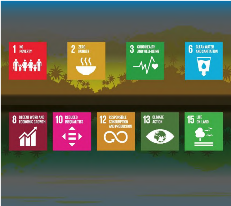
Figure 2 - Impacts of deforestation on Sustainable Development Goals