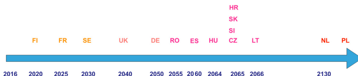
Figure 2. Planned start of operation of deep geological facilities

For the disposal of intermediate level waste, high level waste and spent fuel , the concepts for disposal as per Article 12(1)d of the Directive (e.g. site selection, development of design) are not concrete in most of the Member States, often due to the need for policy decisions to be made or sites to be selected. 22 Of the Member States that are planning to develop geological disposal facilities in the coming decades, only Finland, France and Sweden have so far selected sites, demonstrating the challenges of moving from the planning stage to practical implementation. Globally, Finland is the first country where the construction of a deep geological facility has begun and is expected to be in operation by 2022, with France and Sweden expected to start operation by 2030 (see Figure 2). Another 12 Member States have plans for a deep geological repository and are at different stages of implementation. The majority of Member States without nuclear programmes cover activities up to interim storage and repatriation of spent fuel (if relevant) to the supplier in their national programme and have not yet defined a policy or a route for the disposal of radioactive waste.