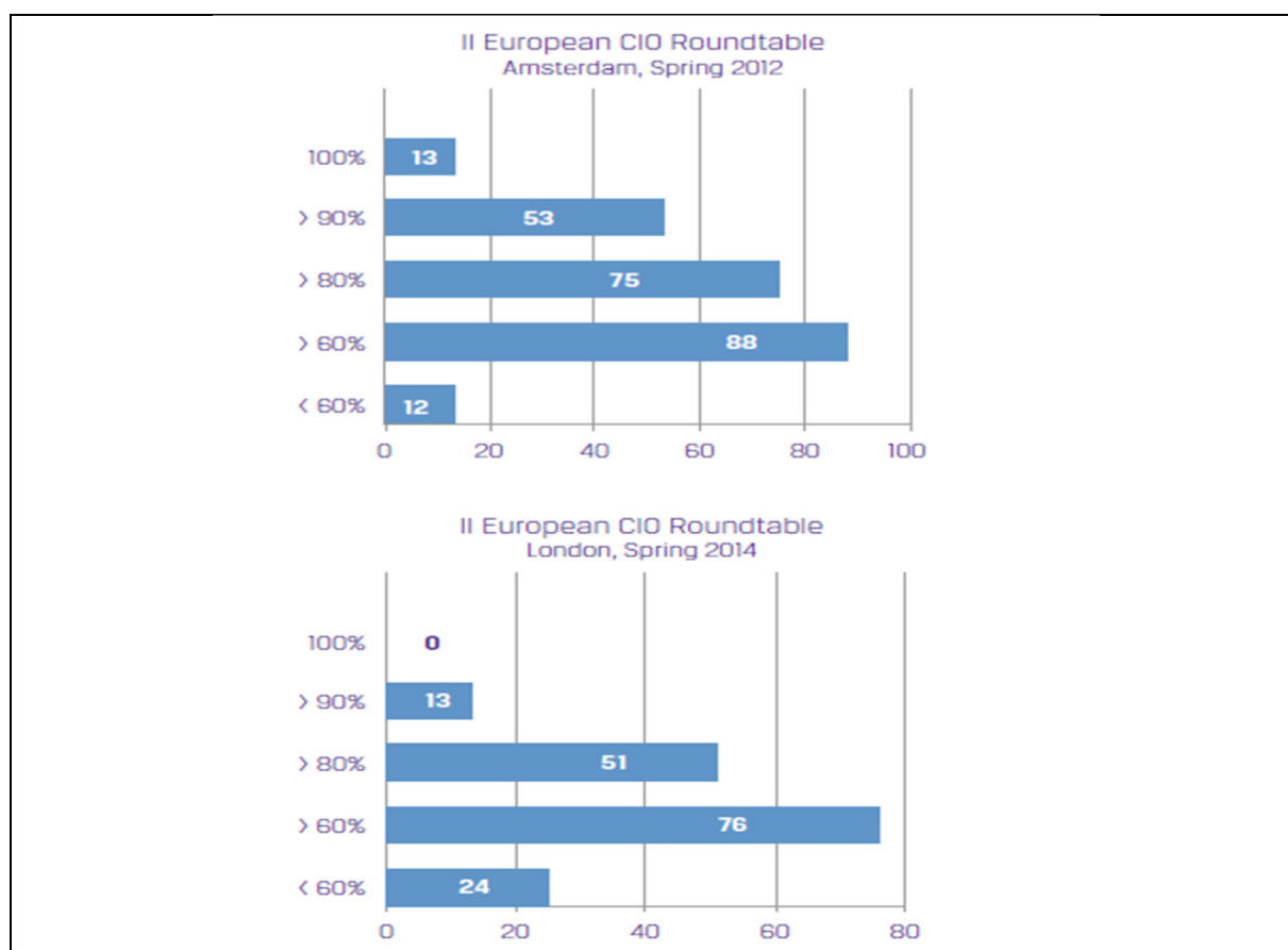
Chart 2: Percentage of total external research budget spent on research products/services from investment banks

Note: The vertical axis depicts the percentage of investment manager external research spending that goes to investment bank research products. The blue bars illustrate what percentage of the investment managers surveyed fell into which buckets (figures are aggregated from 100% down to 60%, and from 0% up to <60%). The chart indicates that bank research products/services are still an important input for most investment managers, although declining in importance between 2012 and 2014. CFA suggests that the apparent decline in the aggregate bank research market share may be a function of managers making greater use of some of the alternatives mentioned such as independent research providers.