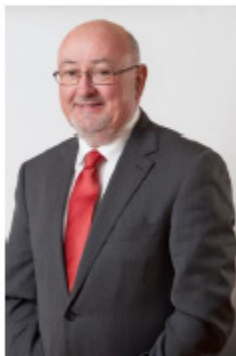
Caoimhghín Ó Caoláin TD (SF) [Chair]