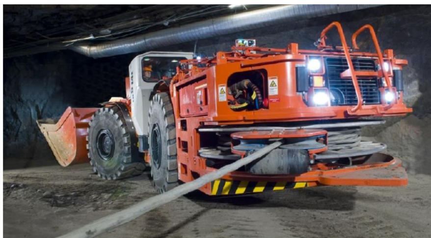
Figure 3: Example of NRMM without on-board power source: a wheel loader used in mining

The current NRMM definition would thus lead, after 22 July 2019, to a situation resulting in very similar types of equipment being regulated differently and inconsistently.