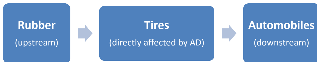
Figure 3: Fictional example of input flows in industry affected by AD

In this example, the tire sector is directly affected by AD action against China and in step 3 we already calculated the magnitude of the negative employment effects for the tire sector when AD duties are lowered if the EU grants MES to China. We will now estimate employment effects in the rubber and automobile industry even when these are not directly affected by AD actions. In reality, each sector will experience both direct and indirect effects