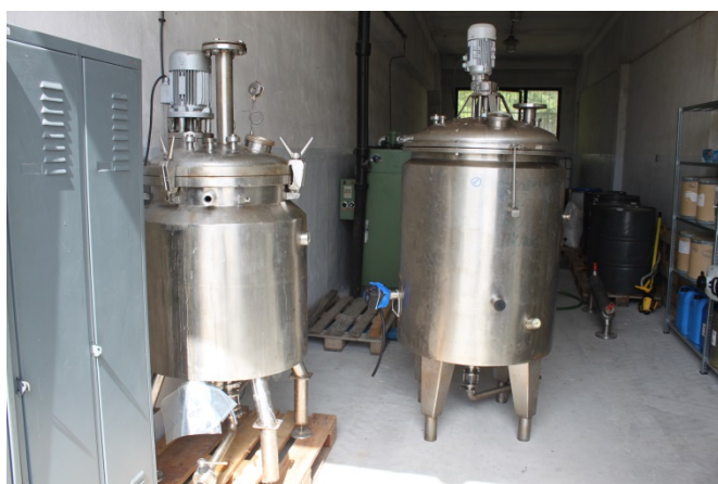
Figure 1. Pictures of the seizure of an industrial scale laboratory in Prievidza, Slovakia.

Contributions reported to Europol by the Member States indicated small scale illicit synthesis of NPS with one exception. In July 2016, the Slovak Police in collaboration with the Polish Police seized an industrial scale laboratory in Prievidza, Slovakia, where the production of 3-CMC (3-chloromethcathinone or clophedrone) and N -ethylnorpentedrone took place (Figure 1).